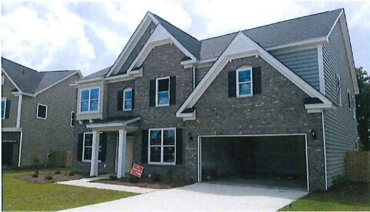
FRONT VIEW 8/1/2016