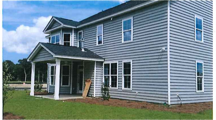
REAR VIEW 8/1/2016