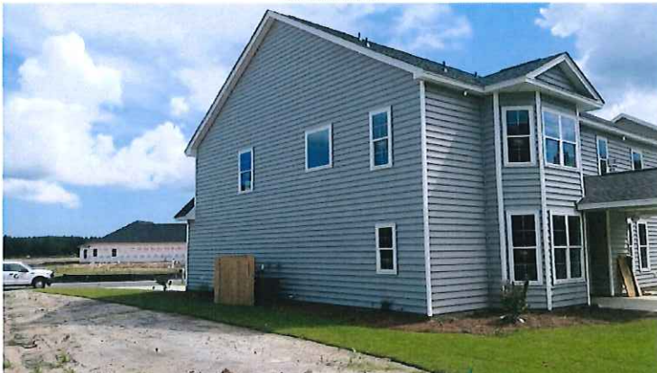
RIGHT VIEW 8/1/2016