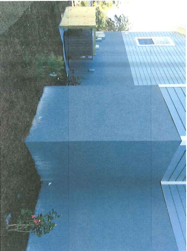
The lowest servicing equipment for C2e located on the right side of house.

If submitting more photographs than will fit on the preceding page, affix the additional photographs below. Identify all photographs with: date taken; "Front View" and "Rear View" and, if required, "Right Side View" and "Left Side View." When applicable, photographs must show the foundation with representative examples of the flood openings or vents, as indicated in Section A8.