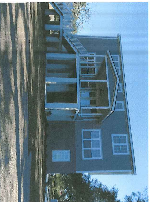
Rear View taken 1/30/2017