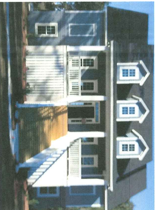
Front View taken 1/30/2017

If using the Elevation Certificate to obtain NFIP flood insurance, affix at least 2 building photographs below according to the instructions for Item A6. Identify all photographs with date taken; "Front view" and Rear view"; and, if required, "Right Side View" and "Left Side View." When applicable, photographs must show the foundation with representative examples of the flood openings or vents, as indicated in Section A8. If submitting more photographs than will fit on this page, use the Continuation Page.