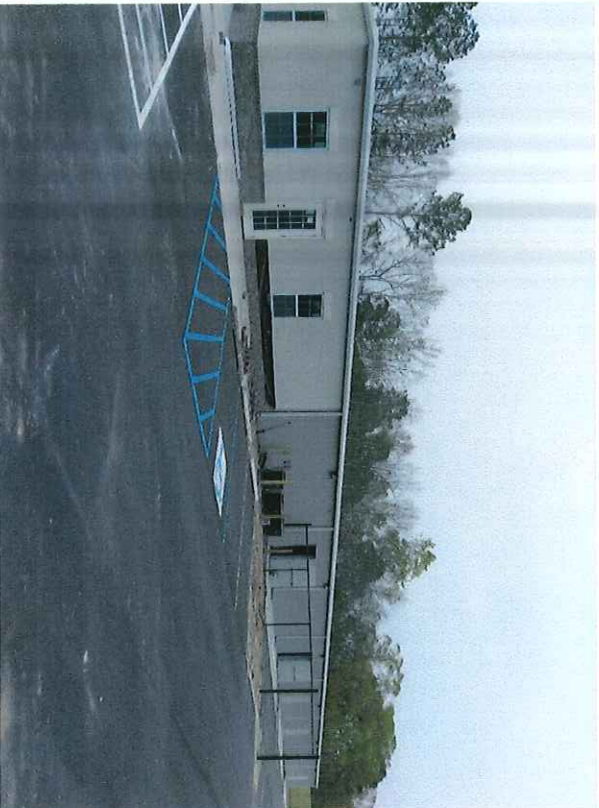
Front View taken 3/13/17 showing lowest servicing equipment for C2e

If using the Elevation Certificate to obtain NF-IP flood insurance, affix at least 2 building photographs below according to the instructions for Item A6. Identify all photographs with date taken; "Front View" and Rear View"; and, if required, "Right Side View" and "Left Side View." When applicable, photographs must show the foundation with representative examples of the flood openings or vents, as indicated in Section A8. If submitting more photographs than will fit on this page, use the Continuation Page.