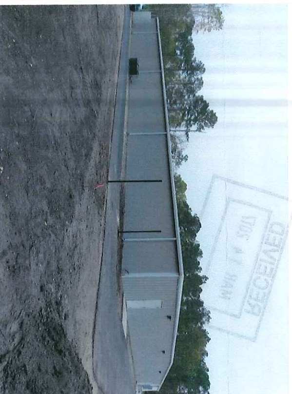
Rear View taken 3/13/17