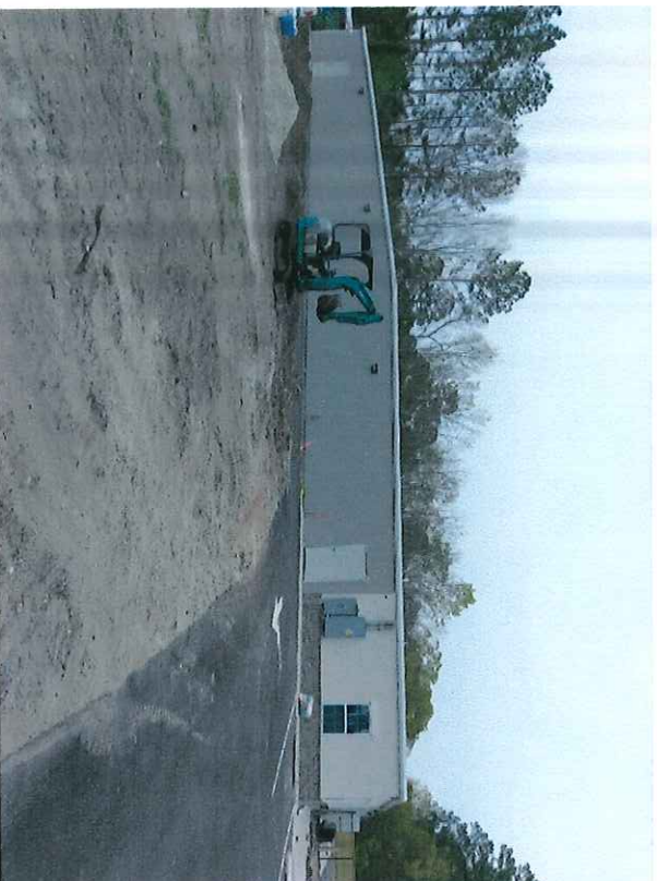
Left Side View taken 3/13/17