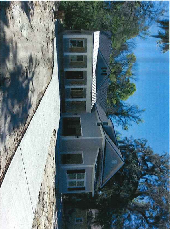
Front View taken 3/16/17

If using the Elevation Certificate to obtain NFIP flood insurance, affix at least 2 building photographs below according to the instructions for Item A6. Identify all photographs with date taken, "Front view" and Rear view", and, if required, "Right Side View" and "Left Side View." When applicable, photographs must show the foundation with representative examples of the flood openings or vents, as indicated in Section A8. If submitting more photographs than will fit on this page, use the Continuation Page.