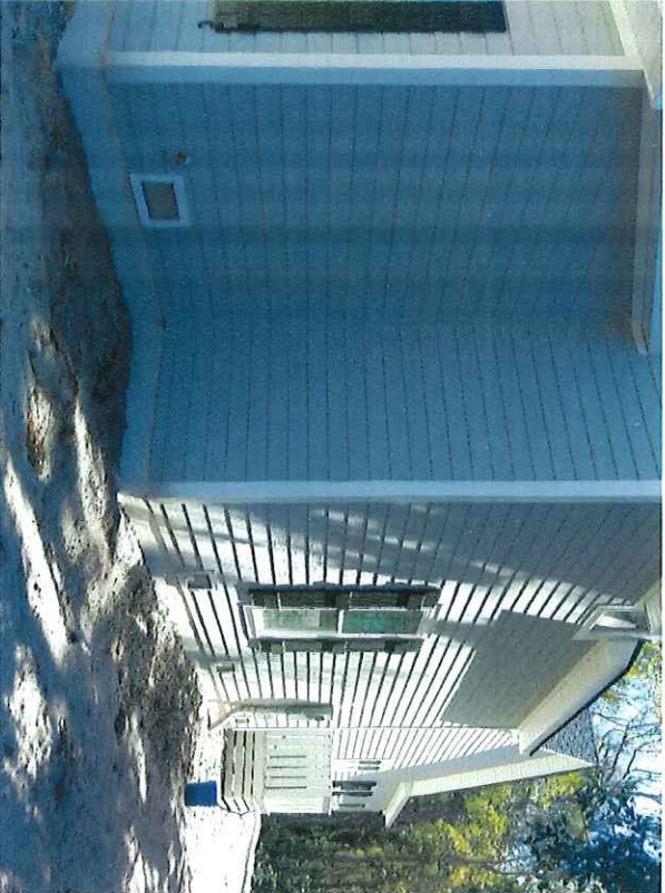
Right Side of house and garage taken 3/16/17 showing Smart Vents