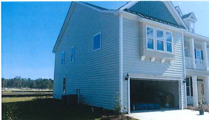
LEFT VIEW 10/19/2016