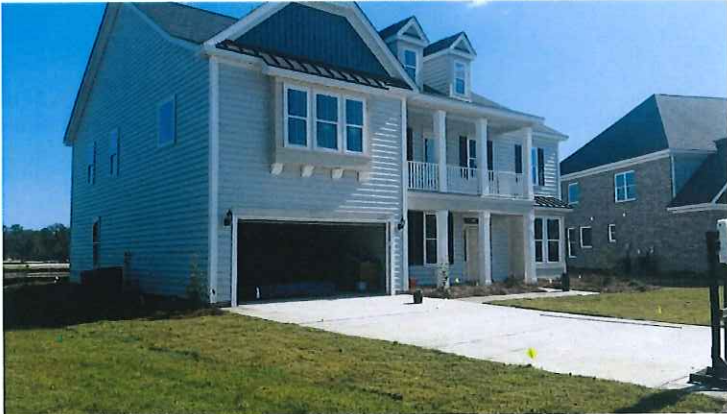
FRONT VIEW 10/19/2016