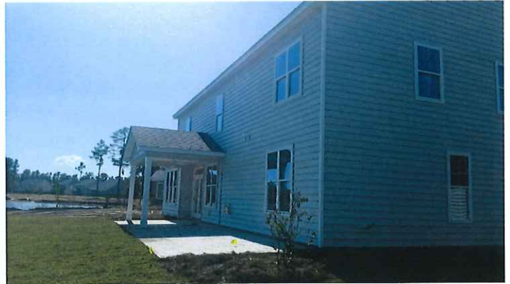
REAR VIEW 10/19/2016