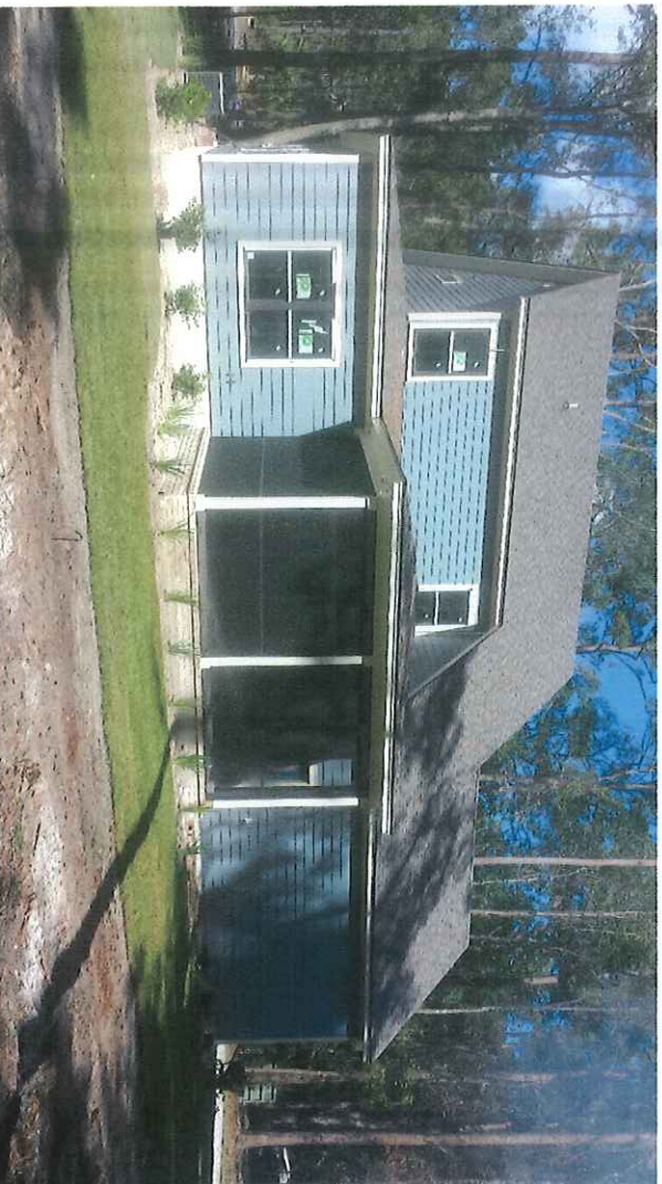
Rear View taken 10/17/16 Lowest servicing equipment for C2e is A/C on left in photo.