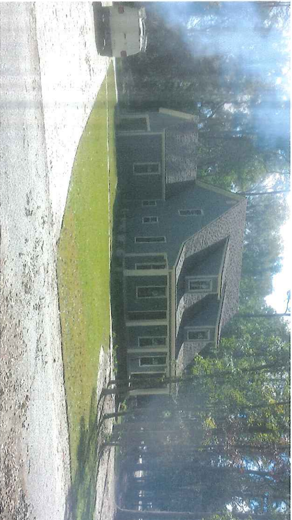
Front View taken 10/17/16

If using the Elevation Certificate to obtain NFIP flood insurance, affix at least 2 building photographs below according to the instructions for Item A6. Identify all photographs with date taken; "Front view" and Rear view", and, if required, "Right Side View" and "Left Side View." When applicable, photographs must show the foundation with representative examples of the flood openings or vents, as indicated in Section A8. If submitting more photographs than will fit on this page, use the Continuation Page.