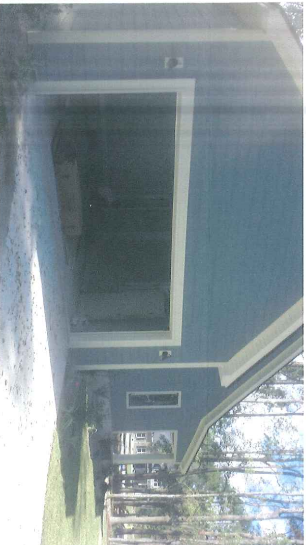
Left side view taken 10/17/16