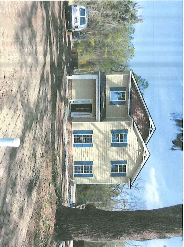
Front View taken 1/14/17

If using the Elevation Certificate to obtain NF-IP flood insurance, affix at least 2 building photographs below according to the instructions for Item A6. Identify all photographs with date taken; "Front View" and Rear View"; and, if required, "Right Side View" and "Left Side View." When applicable, photographs must show the foundation with representative examples of the flood openings or vents, as indicated in Section A8. If submitting more photographs than will fit on this page, use the Continuation Page.