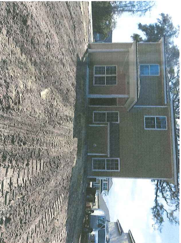
Rear View taken 1/14/17