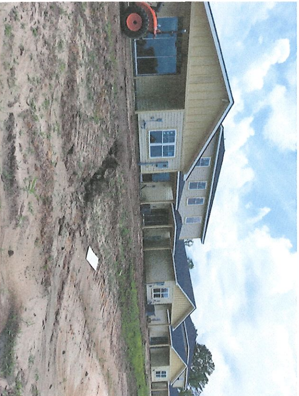
Rear View Taken 5/22/17