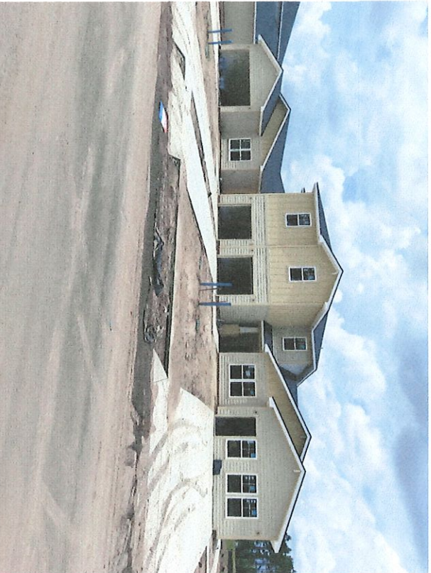
Front View Taken 5/22/17

If using the Elevation Certificate to obtain NFIP flood insurance, affix at least 2 building photographs below according to the instructions for Item A6. Identify all photographs with date taken; "Front view" and Rear view"; and, if required, "Right Side View" and "Left Side View." When applicable, photographs must show the foundation with representative examples of the flood openings or vents, as indicated in Section A8. If submitting more photographs than will fit on this page, use the Continuation Page.