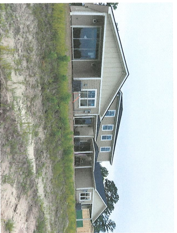
Rear View Taken 6/12/2017