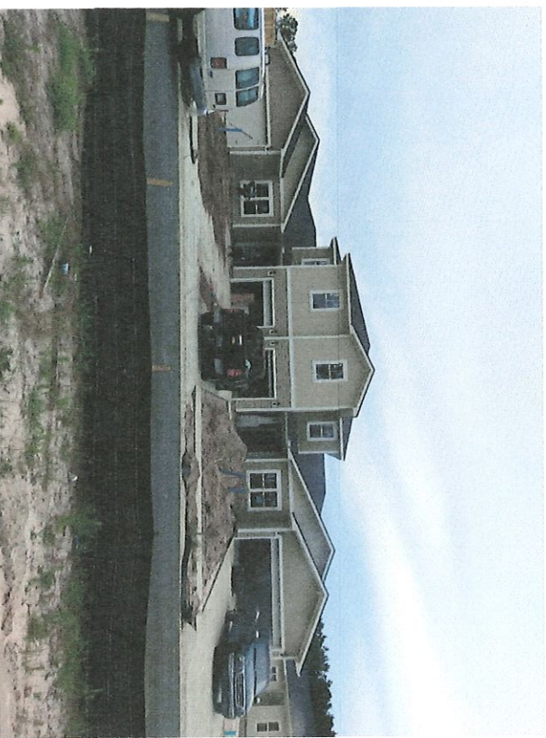
The lowest servicing equipment for C2e is an A/C unit located at the rear of building.