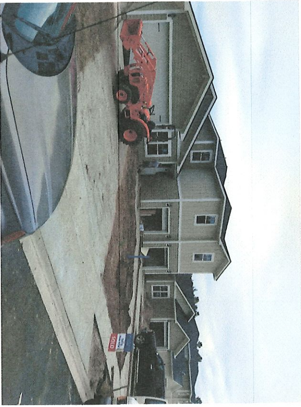
Front View Taken 6/12/2017

If using the Elevation Certificate to obtain NFIP flood insurance, affix at least 2 building photographs below according to the instructions for Item A6. Identify all photographs with date taken, "Front view" and "Rear view"; and, if required, "Right Side View" and "Left Side View." When applicable, photographs must show the foundation with representative examples of the flood openings or vents, as indicated in Section A8. If submitting more photographs than will fit on this page, use the Continuation Page.