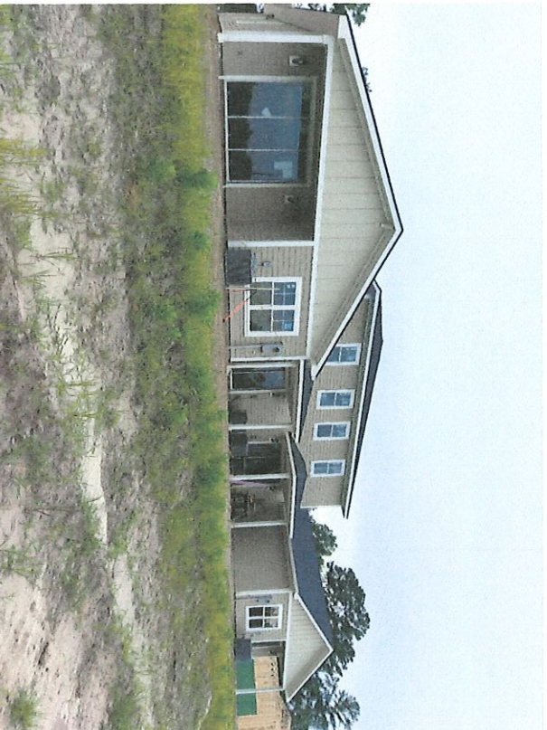
Rear View Taken 6/12/2017