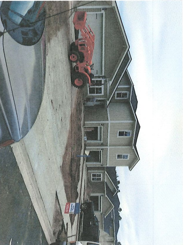
Front View Taken 6/12/2017

If using the Elevation Certificate to obtain NFIP flood insurance, affix at least 2 building photographs below according to the instructions for Item A6. Identify all photographs with date taken; "Front view" and "Rear view"; and, if required, "Right Side View" and "Left Side View." When applicable, photographs must show the foundation with representative examples of the flood openings or vents, as indicated in Section A8. If submitting more photographs than will fit on this page, use the Continuation Page.