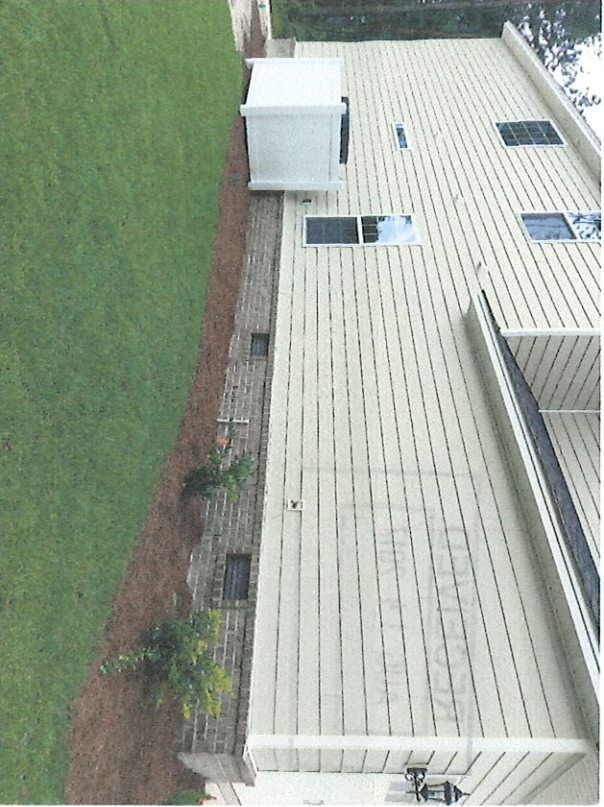
Left Side View taken 8/8/2017 showing typical flood vents