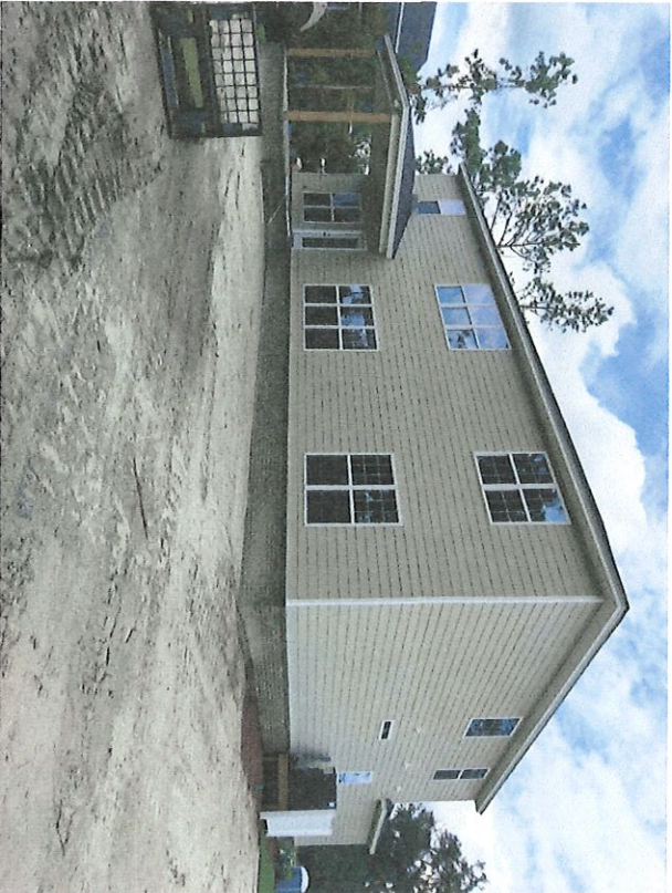
Rear View taken 8/8/2017