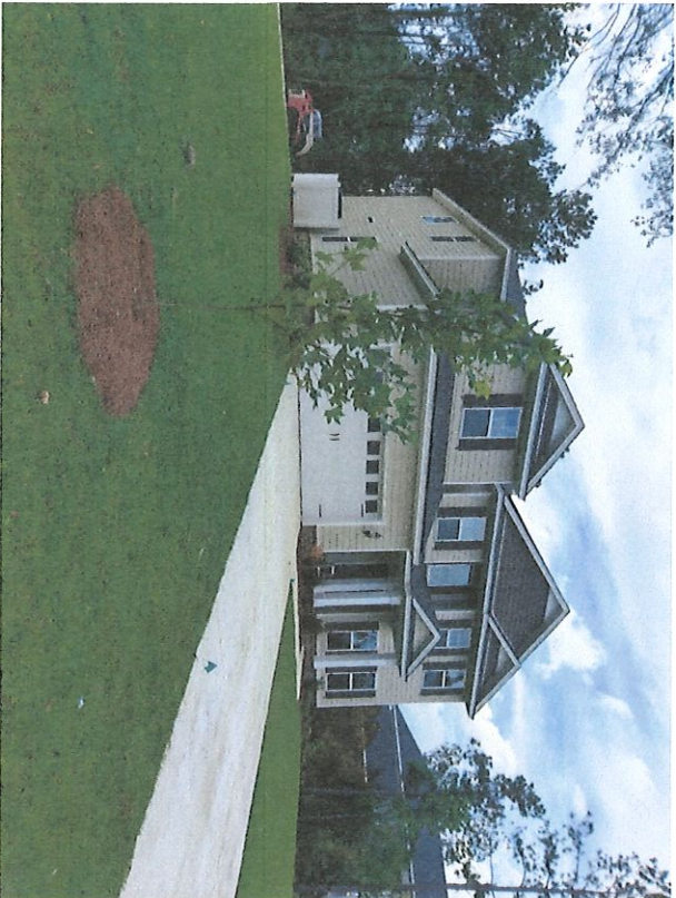
Front View taken 8/8/2017

If using the Elevation Certificate to obtain NFIP flood insurance, affix at least 2 building photographs below according to the instructions for Item A6. Identify all photographs with date taken; "Front view" and Rear view"; and, if required, "Right Side View" and "Left Side View". When applicable, photographs must show the foundation with representative examples of the flood openings or vents, as indicated in Section A8. If submitting more photographs than will fit on this page, use the Continuation Page.