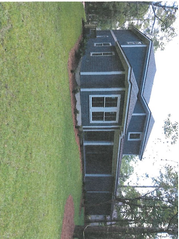
Rear View and Right Side View showing lowest servicing equipment for C2e taken 7/6/2017