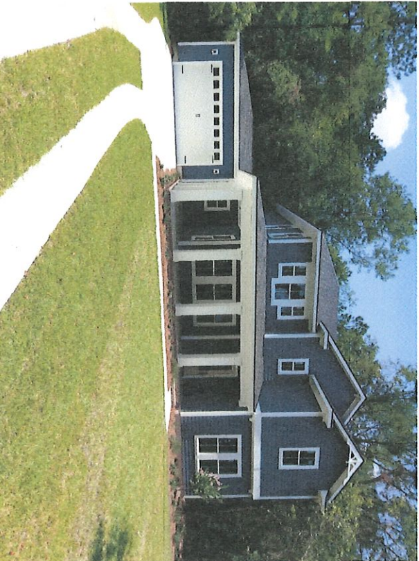
Front View taken 7/6/2017

If using the Elevation Certificate to obtain NFIP flood insurance, affix at least 2 building photographs below according to the instructions for Item A6. Identify all photographs with date taken; "Front view" and Rear view"; and, if required, "Right Side View" and "Left Side View." When applicable, photographs must show the foundation with representative examples of the flood openings or vents, as indicated in Section A8. If submitting more photographs than will fit on this page, use the Continuation Page.