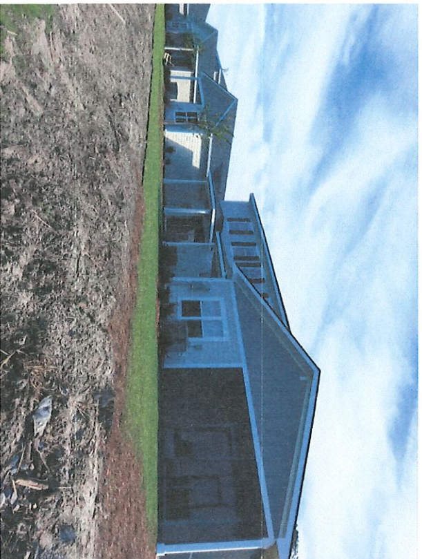
Rear View taken 10/17/17