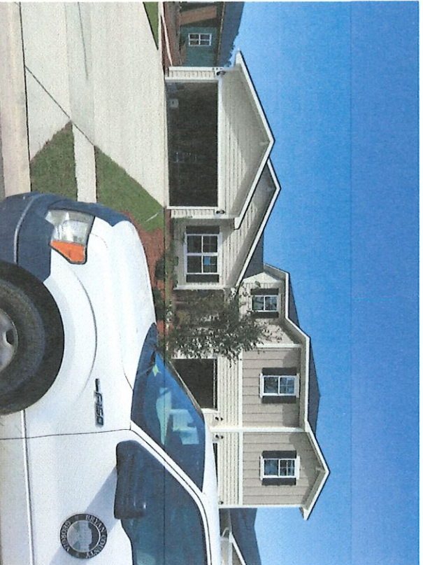
Rear View taken 10/17/17

If using the Elevation Certificate to obtain NF-IP flood insurance, affix at least 2 building photographs below according to the instructions for Item A6. Identify all photographs with date taken; "Front view" and Rear view"; and, if required, "Right Side View" and "Left Side View." When applicable, photographs must show the foundation with representative examples of the flood openings or vents, as indicated in Section A8. If submitting more photographs than will fit on this page, use the Continuation Page.