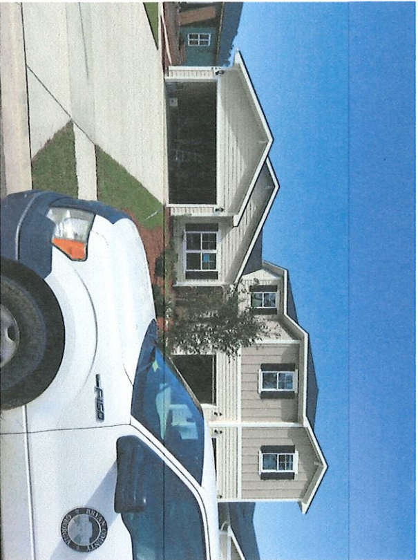
Rear View taken 10/17/17

If using the Elevation Certificate to obtain NF-IP flood insurance, affix at least 2 building photographs below according to the instructions for Item A6. Identify all photographs with date taken; "Front view" and Rear view"; and, if required, "Right Side View" and "Left Side View." When applicable, photographs must show the foundation with representative examples of the flood openings or vents, as indicated in Section A8. If submitting more photographs than will fit on this page, use the Continuation Page.