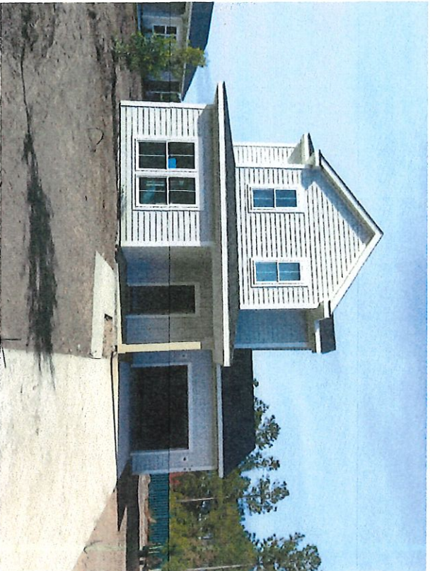
Front View taken 11/20/2017

If using the Elevation Certificate to obtain NF-IP flood insurance, affix at least 2 building photographs below according to the instructions for Item A6. Identify all photographs with date taken, "Front view" and Rear view"; and, if required, "Right Side View" and "Left Side View." When applicable, photographs must show the foundation with representative examples of the flood openings or vents, as indicated in Section A8. If submitting more photographs than will fit on this page, use the Continuation Page.