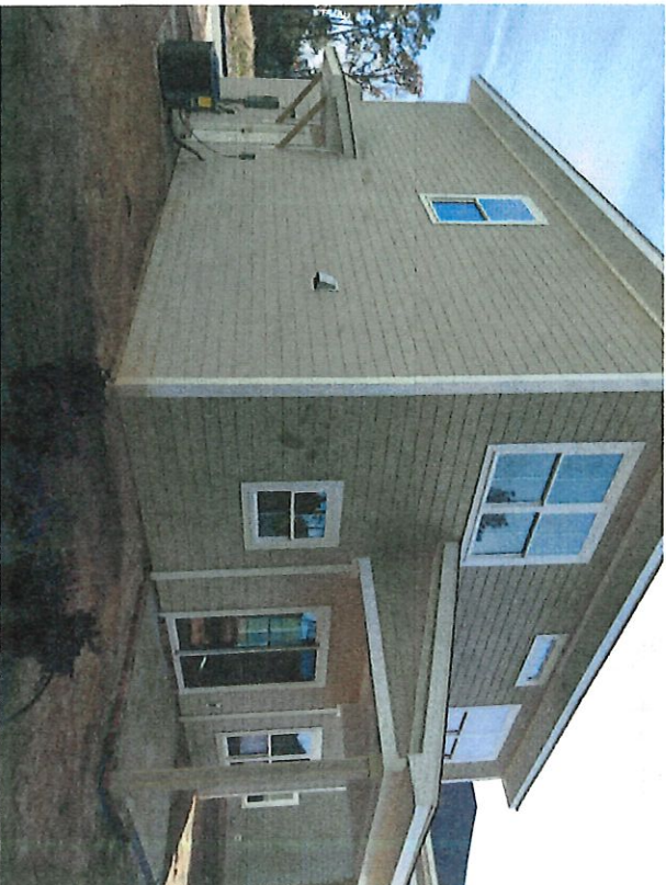
Rear View taken 11/20/2017