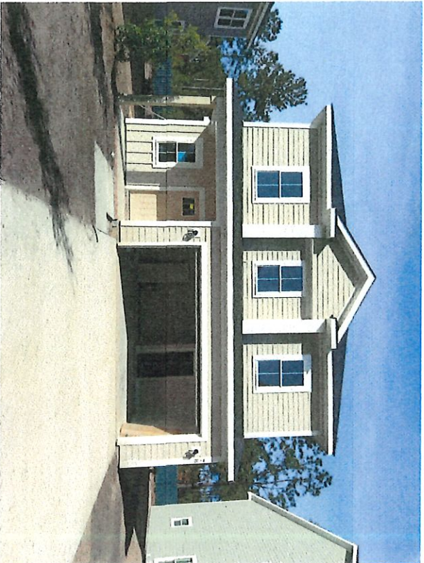
Front View taken 11/20/2017

If using the Elevation Certificate to obtain NFIP flood insurance, affix at least 2 building photographs below according to the instructions for Item A6. Identify all photographs with date taken; "Front view" and Rear view"; and, if required, "Right Side View" and "Left Side View." When applicable, photographs must show the foundation with representative examples of the flood openings or vents, as indicated in Section A8. If submitting more photographs than will fit on this page, use the Continuation Page.