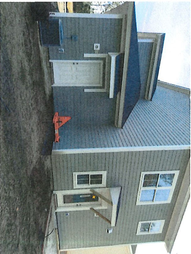
Rear View taken 11/20/2017