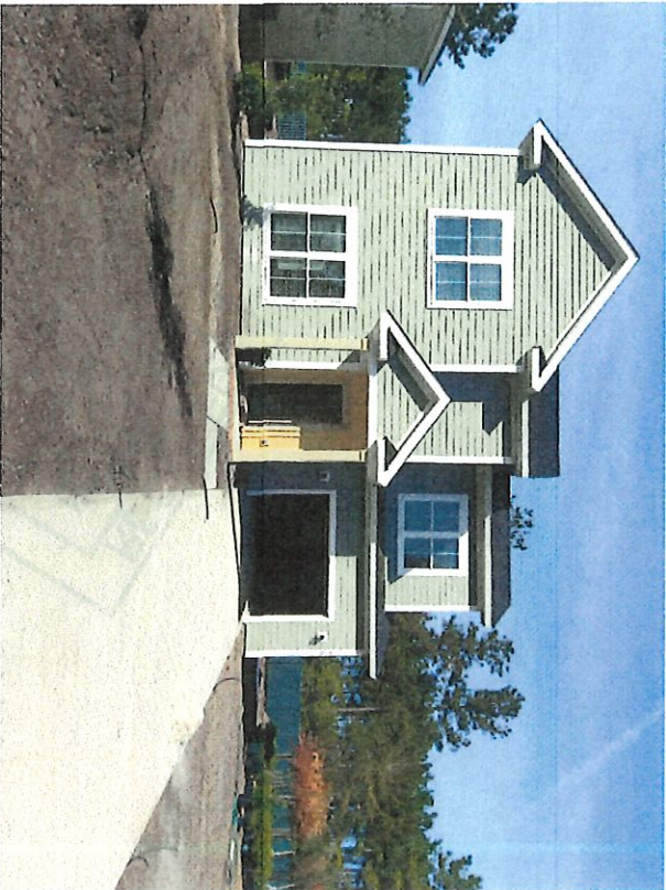
Front View taken 11/20/2017

If using the Elevation Certificate to obtain NFIP flood insurance, affix at least 2 building photographs below according to the instructions for Item A6. Identify all photographs with date taken; "Front View" and Rear view", and, if required, "Right Side View" and "Left Side View." When applicable, photographs must show the foundation with representative examples of the flood openings or vents, as indicated in Section A8. If submitting more photographs than will fit on this page, use the Continuation Page.