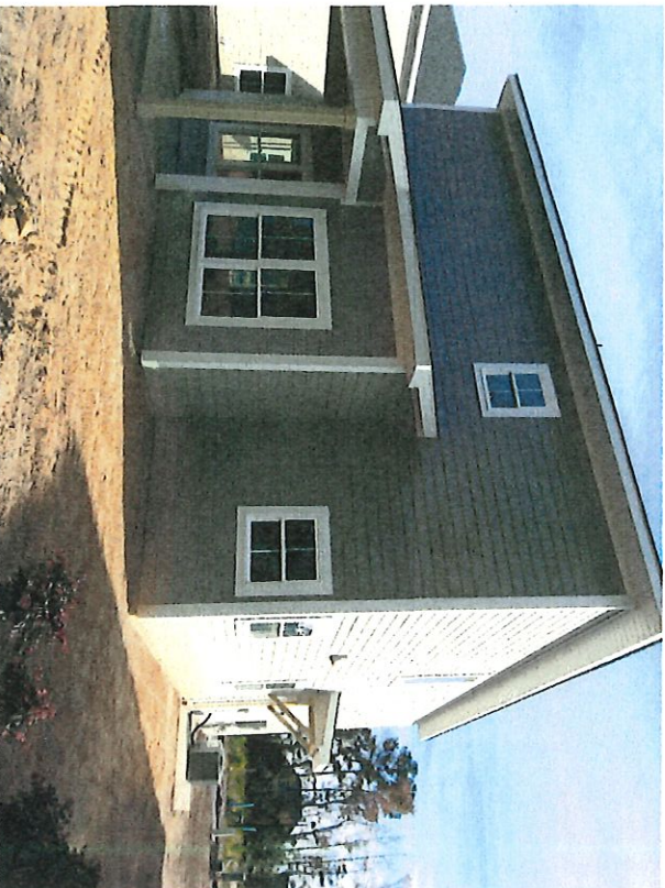
Rear View taken 11/20/2017