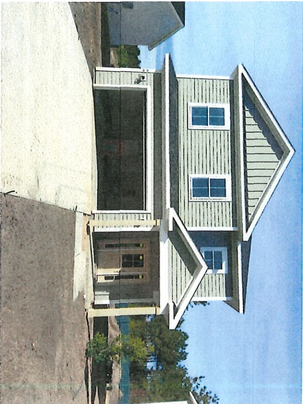
Front View taken 11/20/2017

If using the Elevation Certificate to obtain NFIP flood insurance, affix at least 2 building photographs below according to the instructions for Item A6. Identify all photographs with date taken; "Front view" and Rear view", and, if required, "Right Side View" and "Left Side View." When applicable, photographs must show the foundation with representative examples of the flood openings or vents, as indicated in Section A8. If submitting more photographs than will fit on this page, use the Continuation Page.