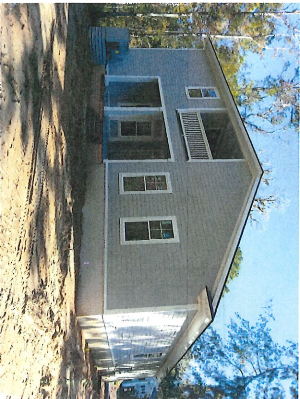
Rear View taken 11/29/2017