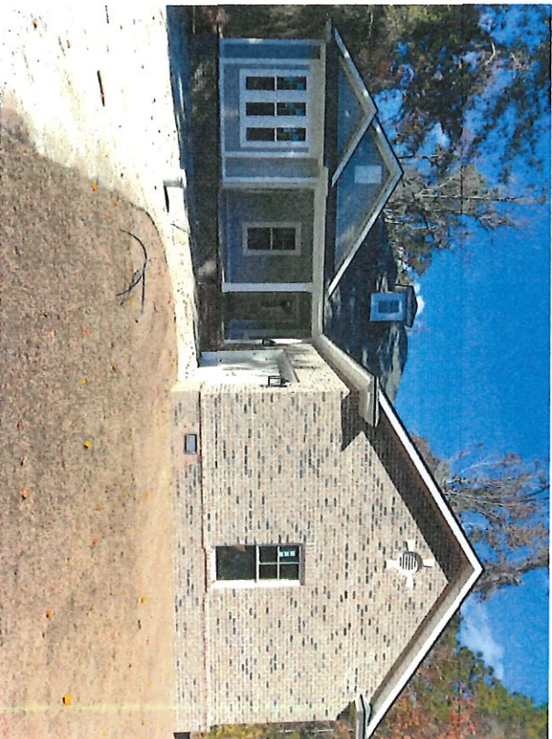
Front View taken 11/29/2017

If using the Elevation Certificate to obtain NFIP flood insurance, affix at least 2 building photographs below according to the instructions for Item A6. Identify all photographs with date taken; "Front view" and Rear view"; and, if required, "Right Side View" and "Left Side View." When applicable, photographs must show the foundation with representative examples of the flood openings or vents, as indicated in Section A8. If submitting more photographs than will fit on this page, use the Continuation Page.