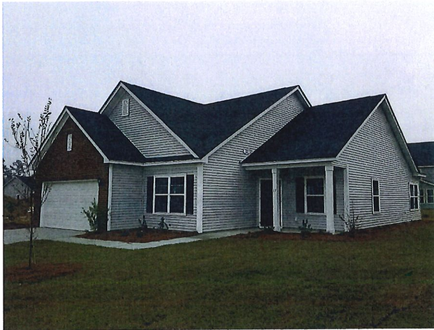
Photo One Caption FRONT RIGHT VIEW 12/5/2017

If using the Elevation Certificate to obtain NFIP flood insurance, affix at least 2 building photographs below according to the instructions for Item A6. Identify all photographs with date taken; "Front View" and "Rear View"; and, if required, "Right Side View" and "Left Side View." When applicable, photographs must show the foundation with representative examples of the flood openings or vents, as indicated in Section A8. If submitting more photographs than will fit on this page, use the Continuation Page.