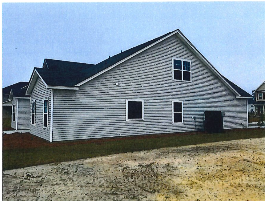
Photo Two Caption REAR LEFT VIEW 12/5/2017