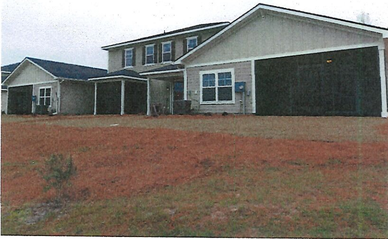
Rear View Taken 2/13/2018