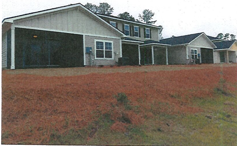
Rear View Taken 2/13/2018