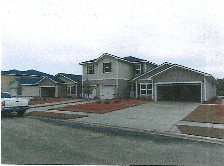
Front View Taken 2/13/2018

If using the Elevation Certificate to obtain NFIP flood insurance, affix at least 2 building photographs below according to the instructions for Item A6. Identify all photographs with date taken; "Front view" and Rear view"; and, if required, "Right Side View" and "Left Side View." When applicable, photographs must show the foundation with representative examples of the flood openings or vents, as indicated in Section A8. If submitting more photographs than will fit on this page, use the Continuation Page.