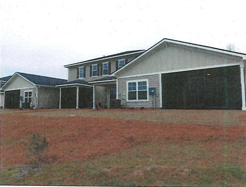
Rear View Taken 2/13/2018