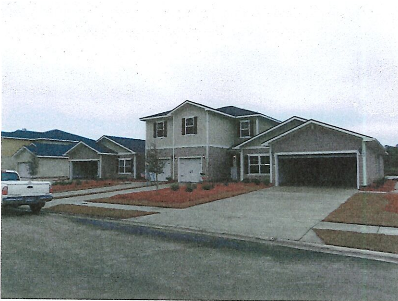
Front View Taken 2/13/2018

If using the Elevation Certificate to obtain NFIP flood insurance, affix at least 2 building photographs below according to the instructions for Item A6. Identify all photographs with date taken; "Front view" and Rear view"; and, if required, "Right Side View" and "Left Side View." When applicable, photographs must show the foundation with representative examples of the flood openings or vents, as indicated in Section A8. If submitting more photographs than will fit on this page, use the Continuation Page.