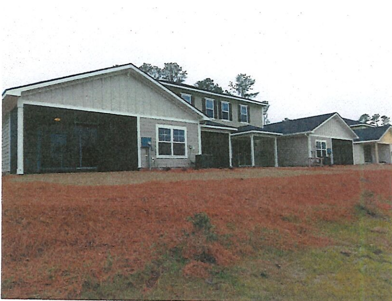
Rear View Taken 2/13/2018