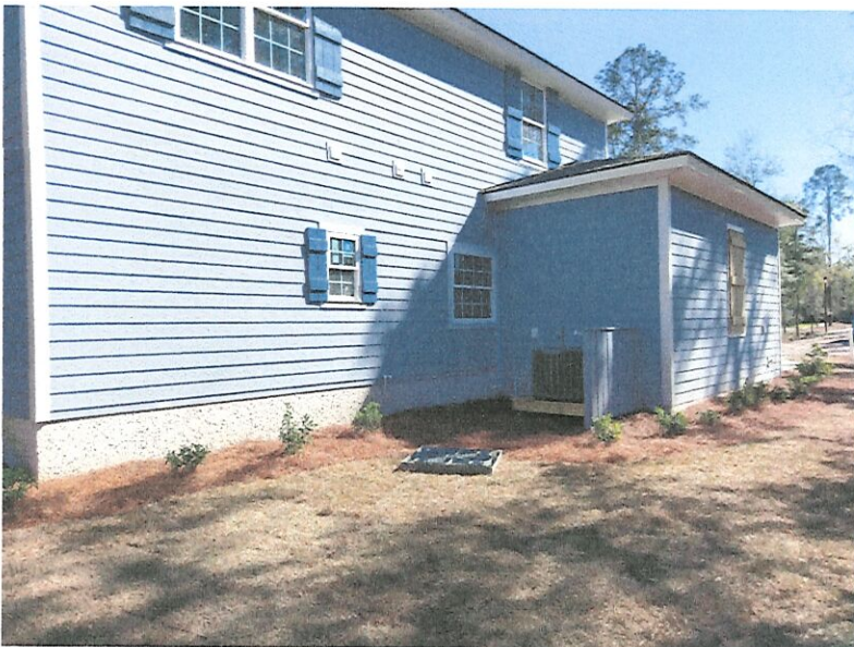
Left Side View taken showing lowest servicing equipment for C2e taken 3/8/2018