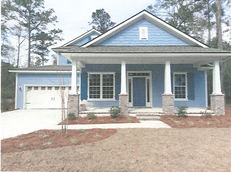
Front View taken 3/5/2018

If using the Elevation Certificate to obtain NFIP flood insurance, affix at least 2 building photographs below according to the instructions for Item A6. Identify all photographs with date taken; "Front view" and Rear view"; and, if required, "Right Side View" and "Left Side View." When applicable, photographs must show the foundation with representative examples of the flood openings or vents, as indicated in Section A8. If submitting more photographs than will fit on this page, use the Continuation Page.