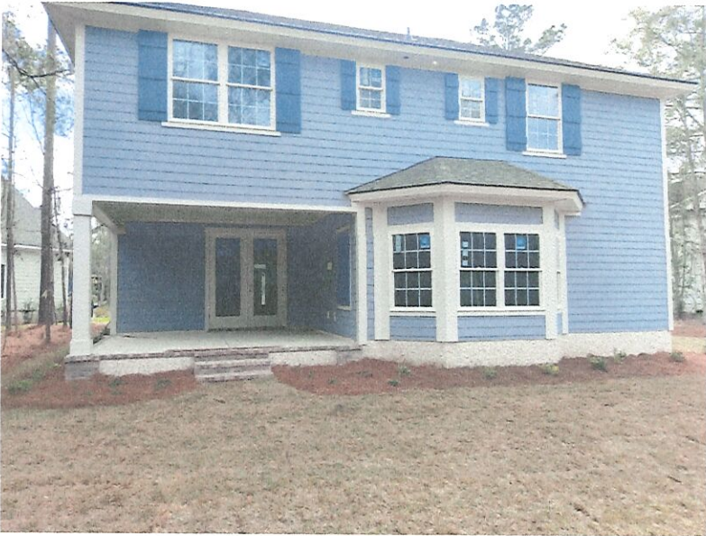
Rear View taken 3/5/2018