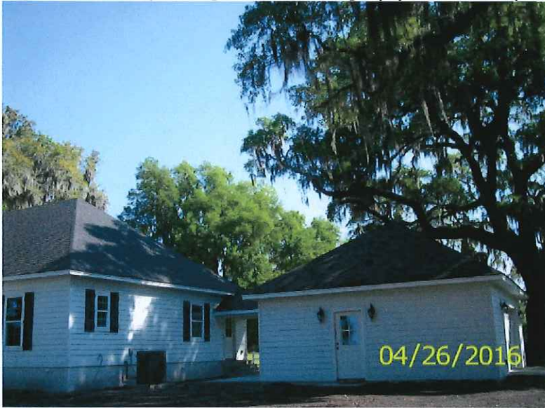
Right Front View (showing lowest servicing equipment for C2e)

If submitting more photographs than will fit on the preceding page, affix the additional photographs below. Identify all photographs with: date taken; "Front View" and "Rear View"; and, if required, "Right Side View" and "Left Side View." When applicable, photographs must show the foundation with representative examples of the flood openings or vents, as indicated in Section A8.