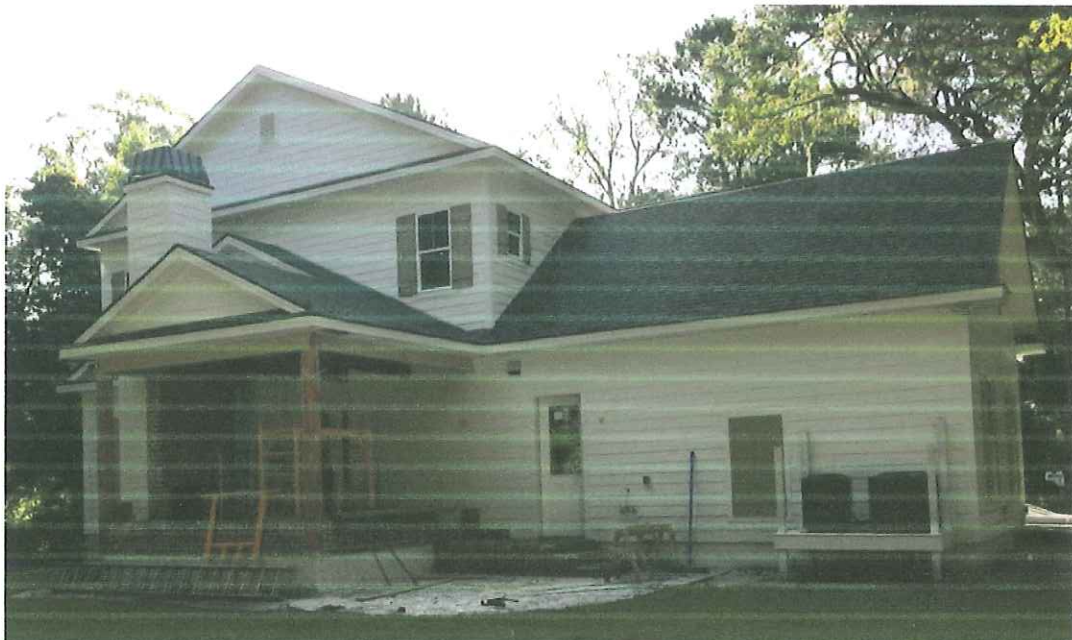
Rear View 6-16-2015