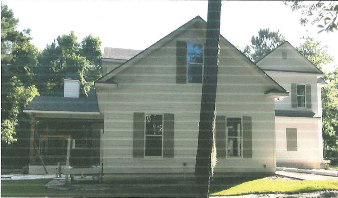
Left Side View 6-16-2015

If submitting more photographs than will fit on the preceding page, affix the additional photographs below. Identify all photographs with: date taken; "Front View" and "Rear View"; and, if required, "Right Side View" and "Left Side View." When applicable, photographs must show the foundation with representative examples of the flood openings or vents, as indicated in Section A8.