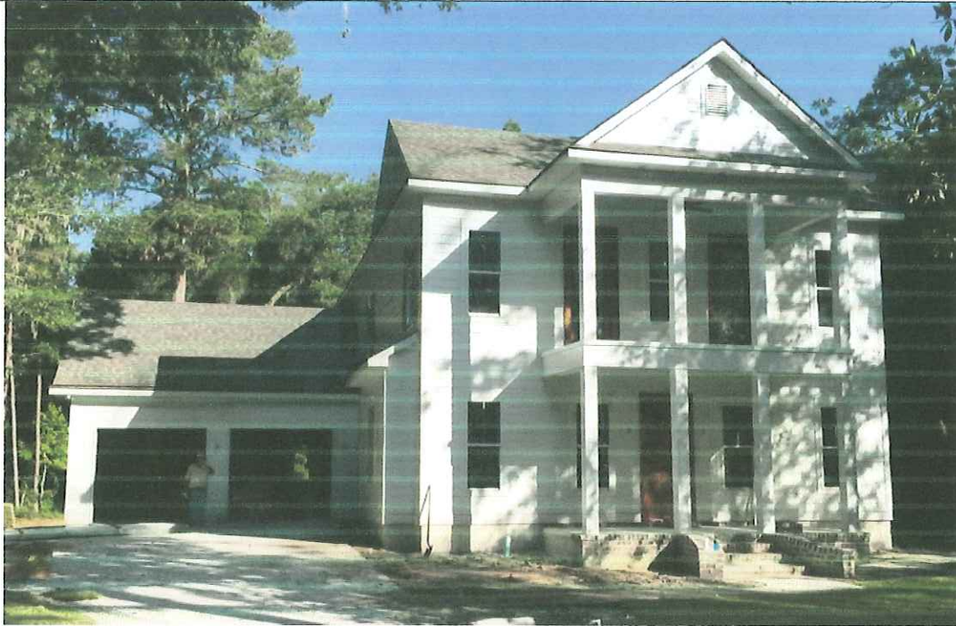
Front View 6-16-2015

If using the Elevation Certificate to obtain NFIP flood insurance, affix at least 2 building photographs below according to the instructions for Item A6. Identify all photographs with date taken; "Front View" and "Rear View"; and, if required, "Right Side View" and "Left Side View." When applicable, photographs must show the foundation with representative examples of the flood openings or vents, as indicated in Section A8. If submitting more photographs than will fit on this page, use the Continuation Page.