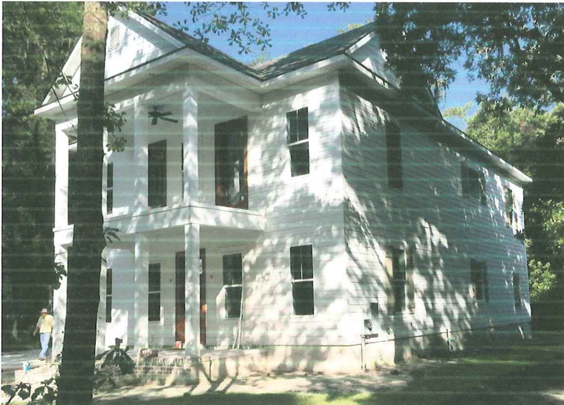
Right Side View 6-16-2015