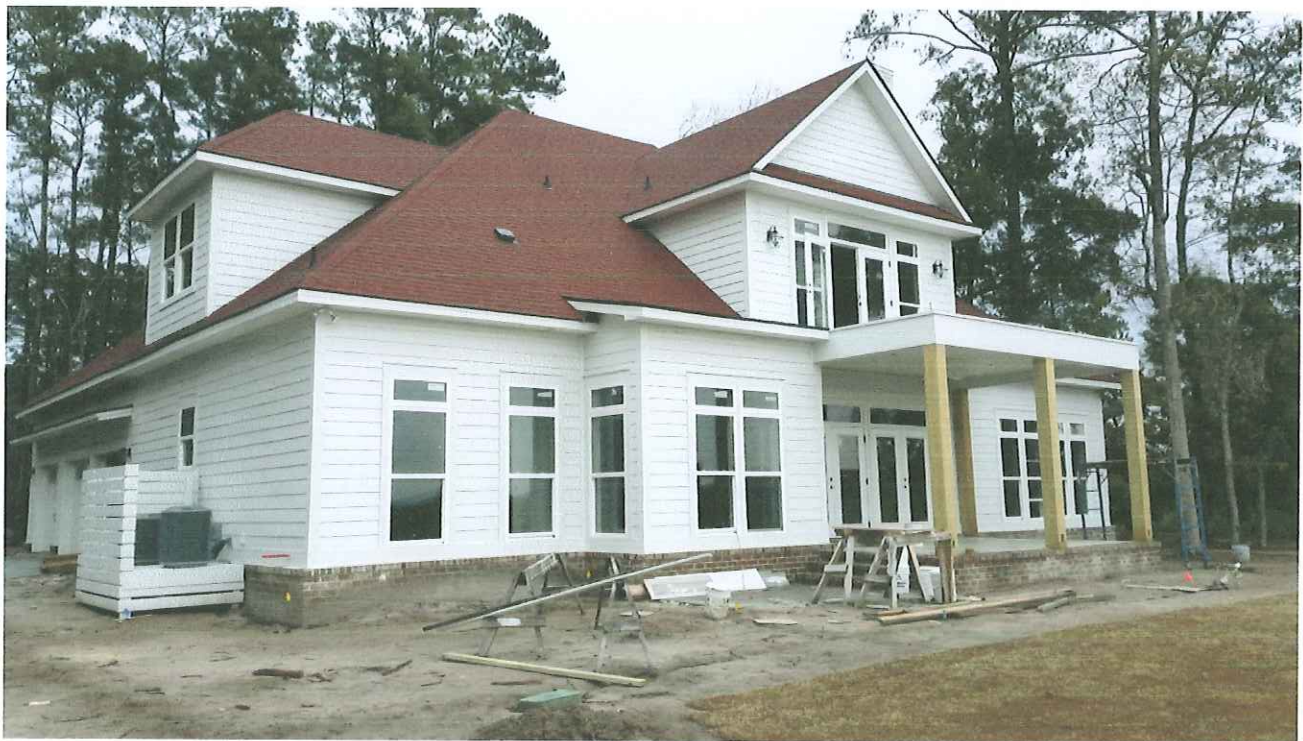
Rear View 2-10-2015