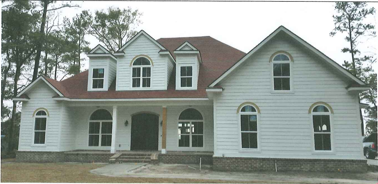
Front View 2-10-2015

If using the Elevation Certificate to obtain NFIP flood insurance, affix at least 2 building photographs below according to the instructions for Item A6. Identify all photographs with date taken; "Front View" and "Rear View"; and, if required, "Right Side View" and "Left Side View." When applicable, photographs must show the foundation with representative examples of the flood openings or vents, as indicated in Section A8. If submitting more photographs than will fit on this page, use the Continuation Page.