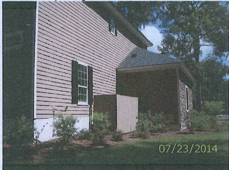
Left Side View (Showing A/C unit and Smart vents in rear of Secondary garage)

If submitting more photographs than will fit on the preceding page, affix the additional photographs below. Identify all photographs with: date taken; "Front View" and "Rear View"; and, if required, "Right Side View" and "Left Side View." When applicable, photographs must show the foundation with representative examples of the flood openings or vents, as indicated in Section A8.