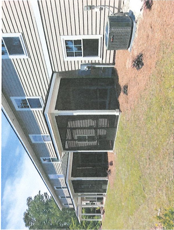
Rear View taken 4/26/2018