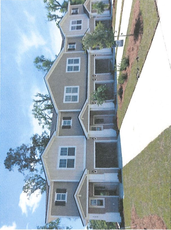
Front View taken 4/26/2018

If using the Elevation Certificate to obtain NFIP flood insurance, affix at least 2 building photographs below according to the instructions for Item A6. Identify all photographs with date taken; "Front view" and Rear view"; and, if required, "Right Side View" and "Left Side View." When applicable, photographs must show the foundation with representative examples of the flood openings or vents, as indicated in Section A8. If submitting more photographs than will fit on this page, use the Continuation Page.