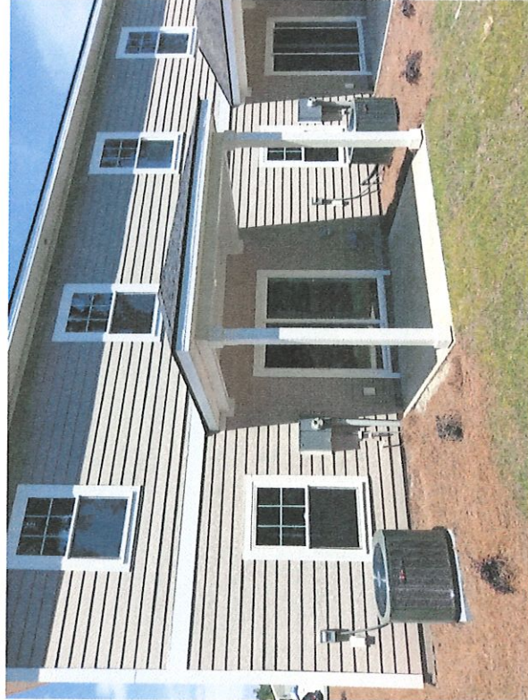
Rear View taken 4/26/2018