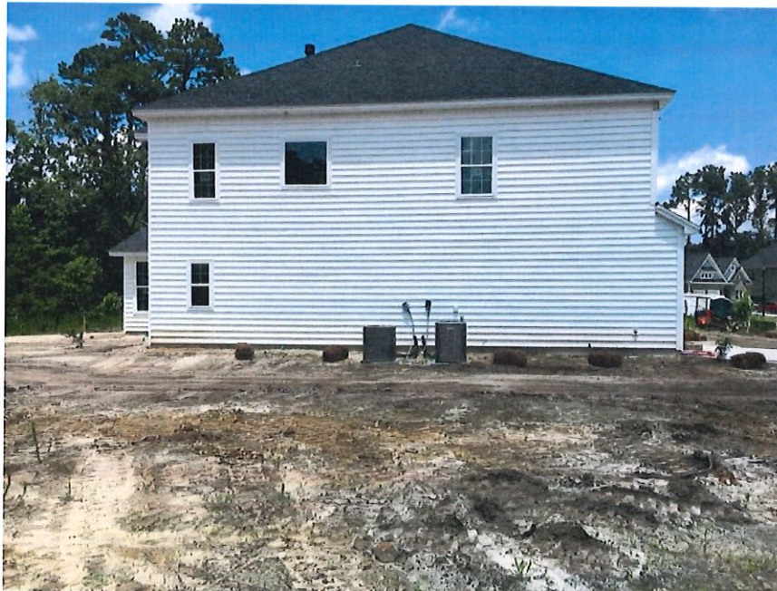
Photo Two Caption LEFT VIEW 6/1/2018