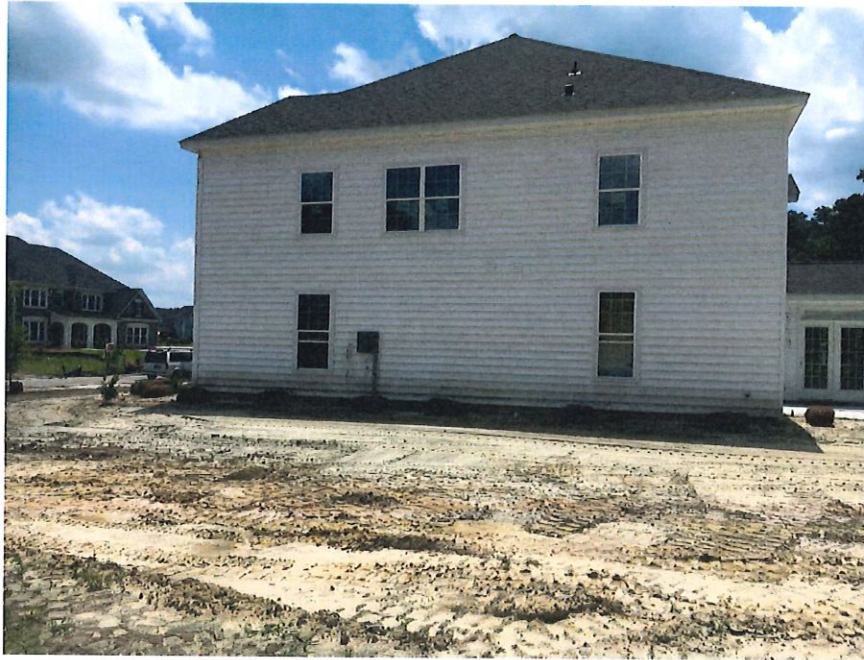
Photo One Caption RIGHT VIEW 6/1/2018

If submitting more photographs than will fit on the preceding page, affix the additional photographs below. Identify all photographs with: date taken; "Front View" and "Rear View"; and, if required, "Right Side View" and "Left Side View." When applicable, photographs must show the foundation with representative examples of the flood openings or vents, as indicated in Section A8.