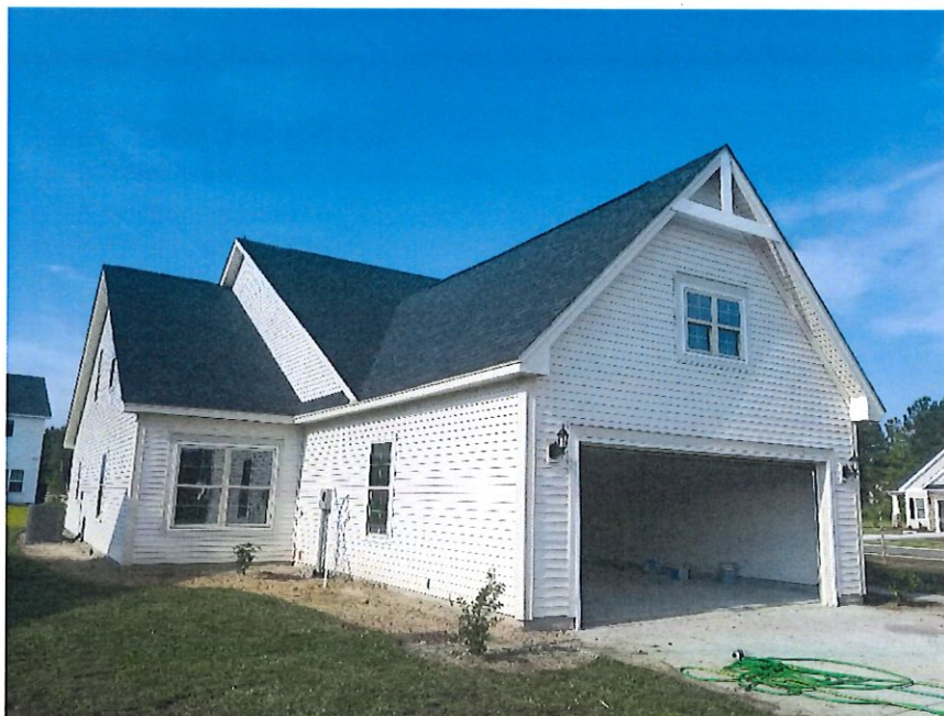
Photo Two Caption LEFT VIEW 6/11/2018