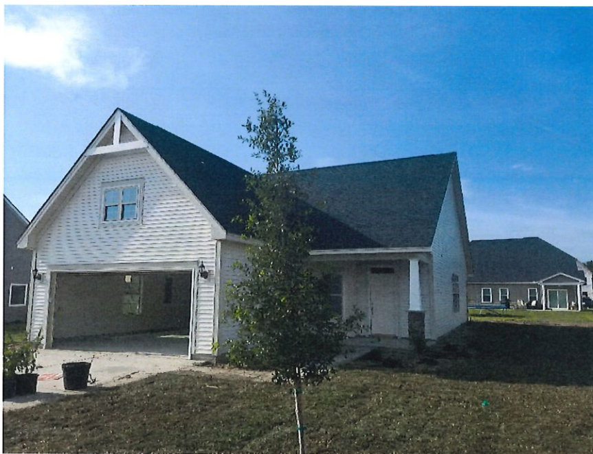
Photo One Caption RIGHT VIEW 6/11/2018

If submitting more photographs than will fit on the preceding page, affix the additional photographs below. Identify all photographs with: date taken; "Front View" and "Rear View"; and, if required, "Right Side View" and "Left Side View." When applicable, photographs must show the foundation with representative examples of the flood openings or vents, as indicated in Section A8.