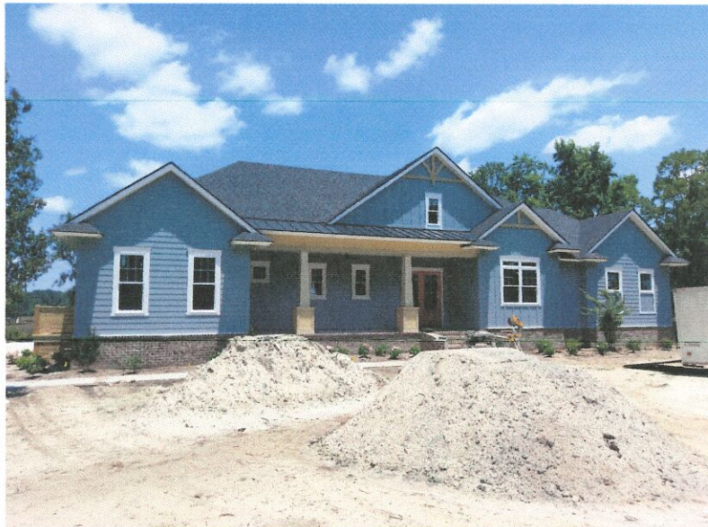
Front View taken 6/11/2018

If using the Elevation Certificate to obtain NFIP flood insurance, affix at least 2 building photographs below according to the instructions for Item A6. Identify all photographs with date taken; "Front view" and Rear view"; and, if required, "Right Side View" and "Left Side View." When applicable, photographs must show the foundation with representative examples of the flood openings or vents, as indicated in Section A8. If submitting more photographs than will fit on this page, use the Continuation Page.