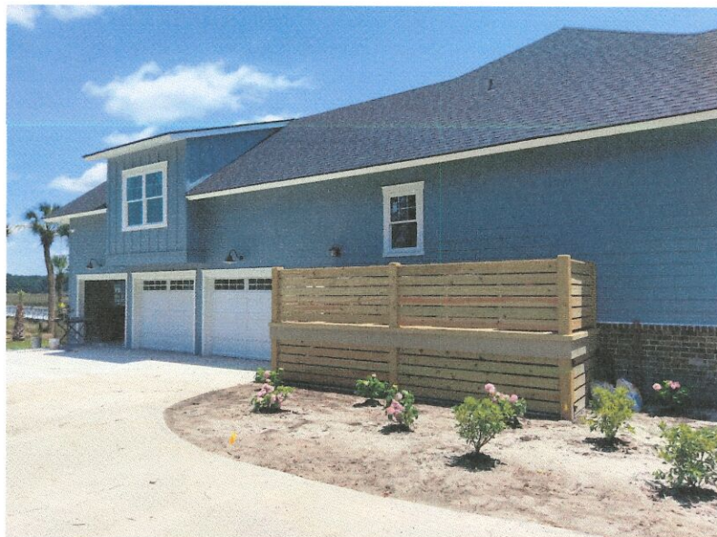
Left Side View taken 6/11/2018 showing lowest servicing equipment for C2e and next higher floor (C2b above garage).