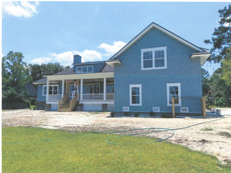
Rear View taken 6/11/2018 showing typical flood vents in garage