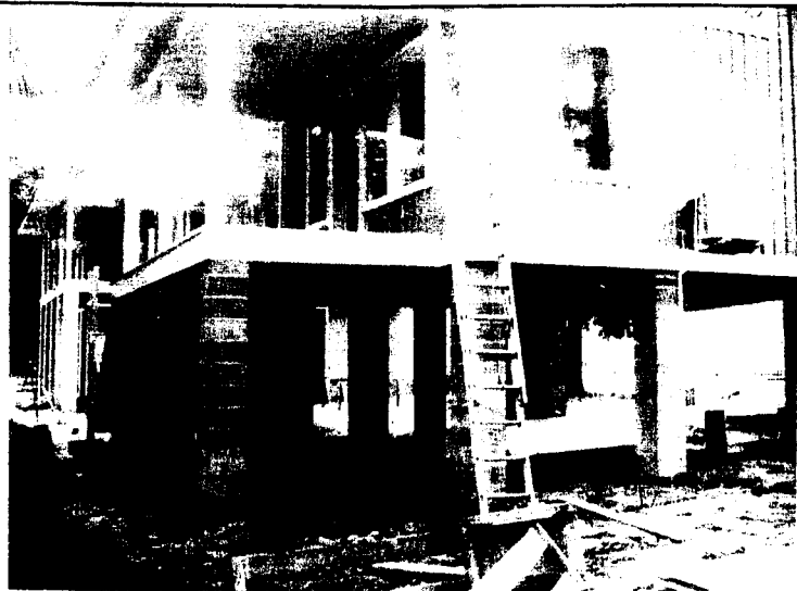
FRONT VIEW 02/10/2009