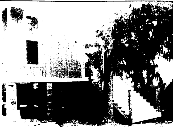
LEFT SIDE VIEW 02/10/2009