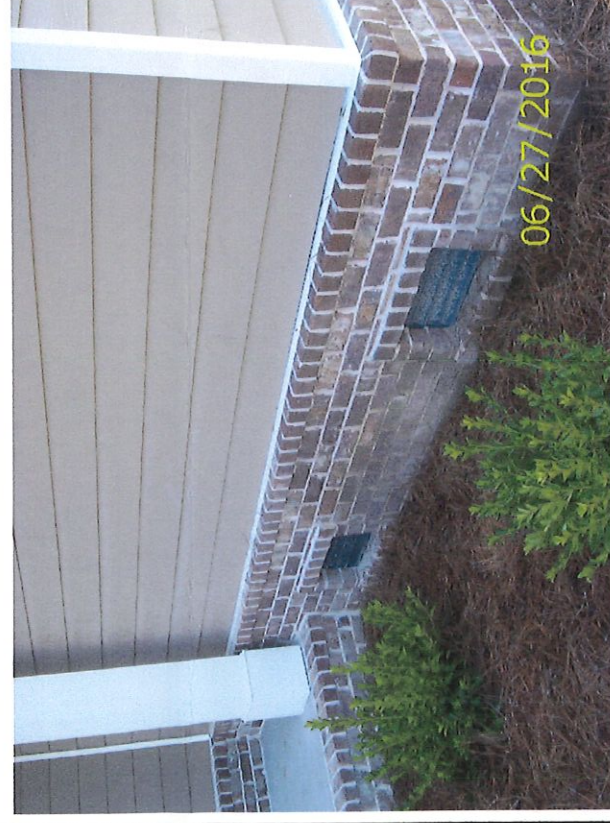
Engineered Flood Vents (typical)