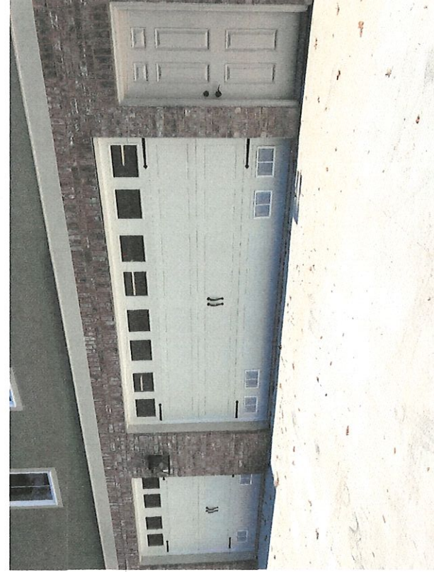
Garage Apartment Front View taken 11/14/17