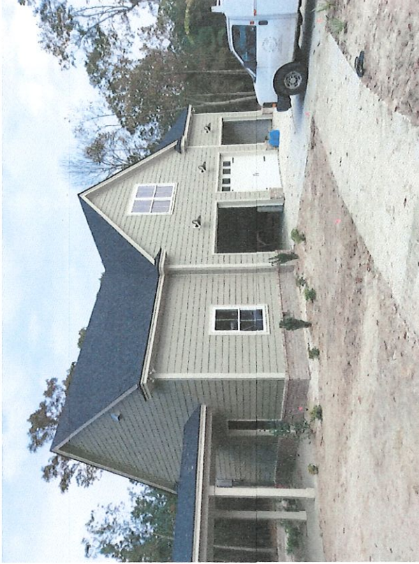
Garage Apartment Front View taken 11/8/17

If using the Elevation Certificate to obtain NFIP flood insurance, affix at least 2 building photographs below according to the instructions for Item A6. Identify all photographs with date taken; "Front view" and Rear view"; and, if required, "Right Side View" and "Left Side View." When applicable, photographs must show the foundation with representative examples of the flood openings or vents, as indicated in Section A8. If submitting more photographs than will fit on this page, use the Continuation Page.