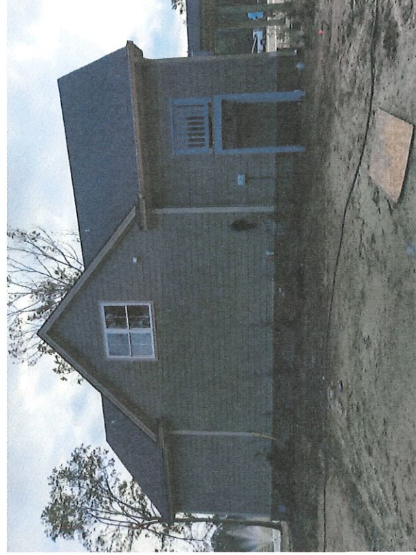
Garage Apartment Rear View taken 11/8/17