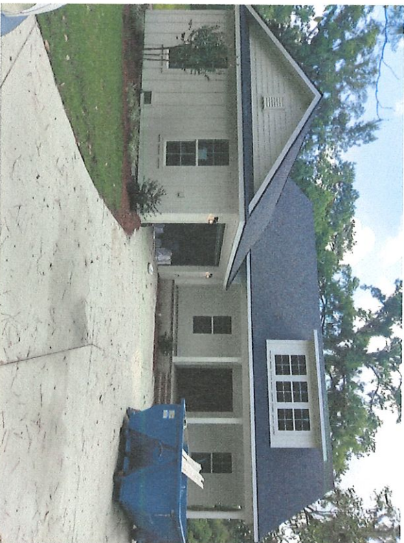
Front View taken 6/11/2019

If using the Elevation Certificate to obtain NFIP flood insurance, affix at least 2 building photographs below according to the instructions for Item A6. Identify all photographs with date taken, "Front view" and Rear view", and, if required, "Right Side View" and "Left Side View." When applicable, photographs must show the foundation with representative examples of the flood openings or vents, as indicated in Section A8. If submitting more photographs than will fit on this page, use the Continuation Page.