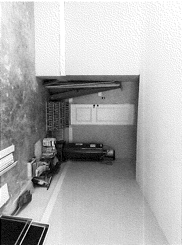
Inside View of garage showing the lowest servicing equipment for C2e

If submitting more photographs than will fit on the preceding page, affix the additional photographs below. Identify all photographs with: date taken; "Front View" and "Rear View" and, if required, "Right Side View" and "Left Side View." When applicable, photographs must show the foundation with representative examples of the flood openings or vents, as indicated in Section A8.