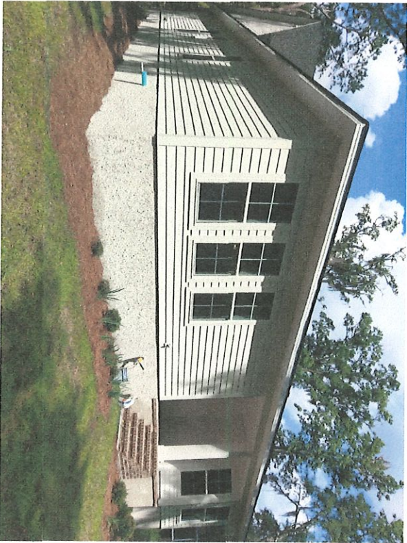
Rear View taken 6/11/2019