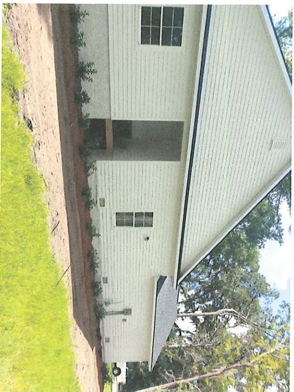
Left Side View taken 6/11/2019