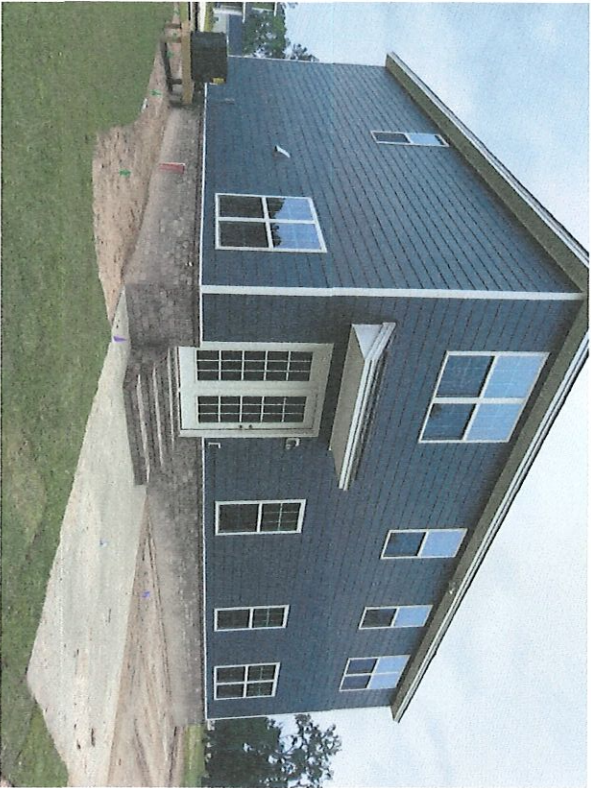
Rear View taken 6/6/2019