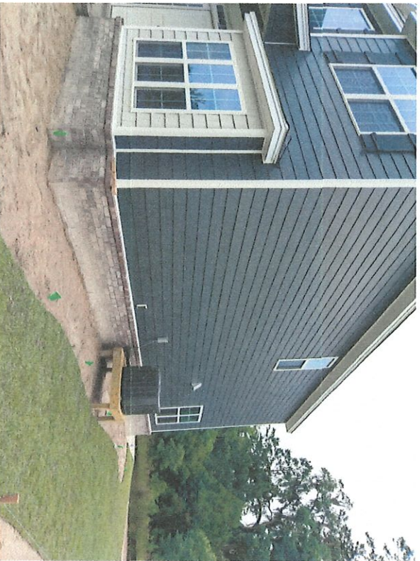
Right Side View taken 6/6/2019 showing the lowest servicing equipment for C2e