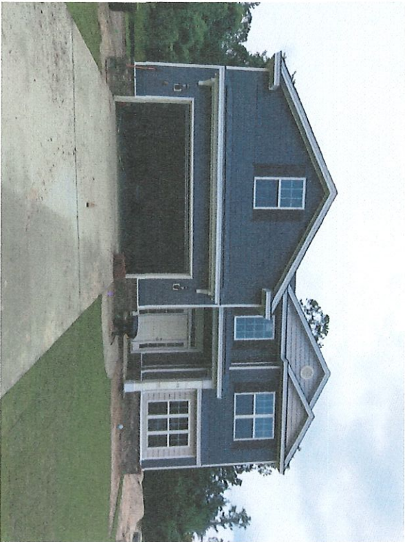
Front View taken 6/6/2019

If using the Elevation Certificate to obtain NFIP flood insurance, affix at least 2 building photographs below according to the instructions for Item A6. Identify all photographs with date taken; "Front view" and Rear view"; and, if required, "Right Side View" and "Left Side View." When applicable, photographs must show the foundation with representative examples of the flood openings or vents, as indicated in Section A8. If submitting more photographs than will fit on this page, use the Continuation Page.