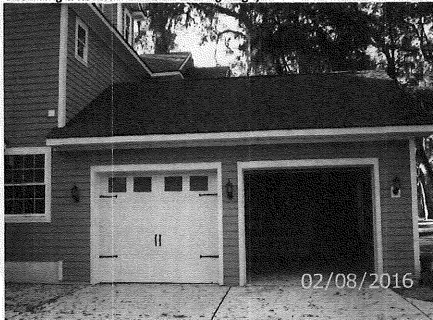
Left Side View of Main Garage C2d (showing lowest servicing equipment for C2e being a hot water heater inside garage)

If submitting more photographs than will fit on the preceding page, affix the additional photographs below. Identify all photographs with: date taken; "Front View" and "Rear View"; and, if required, "Right Side View" and "Left Side View." When applicable, photographs must show the foundation with representative examples of the flood openings or vents, as indicated in Section A8.