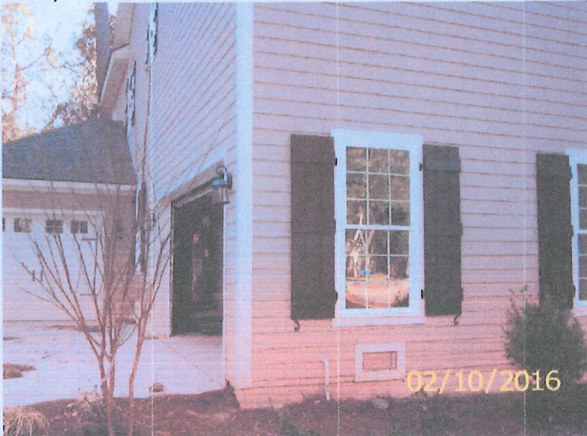
Inside C2d showing lowest servicing equipment for C2e (inside garage door On left)

If submitting more photographs than will fit on the preceding page, affix the additional photographs below. Identify all photographs with: date taken; "Front View" and "Rear View"; and, if required, "Right Side View" and "Left Side View." When applicable, photographs must show the foundation with representative examples of the flood openings or vents, as indicated in Section A8.