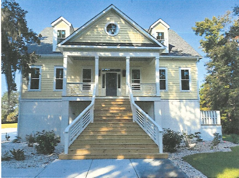
Front View taken 10/04/2019

If using the Elevation Certificate to obtain NFIP flood insurance, affix at least 2 building photographs below according to the instructions for Item A6. Identify all photographs with date taken; "Front view" and Rear view"; and, if required, "Right Side View" and "Left Side View." When applicable, photographs must show the foundation with representative examples of the flood openings or vents, as indicated in Section A8. If submitting more photographs than will fit on this page, use the Continuation Page.