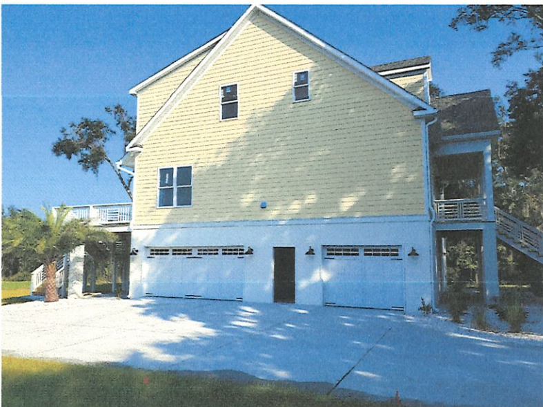
Left Side View taken 10/04/2019