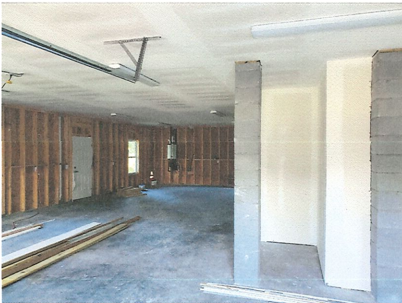
View of C2a being fully enclosed taken 10/04/2019