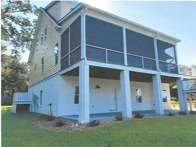
Rear View taken 10/04/2019 showing lowest servicing equipment for C2e (on elevated platform at left in photo)