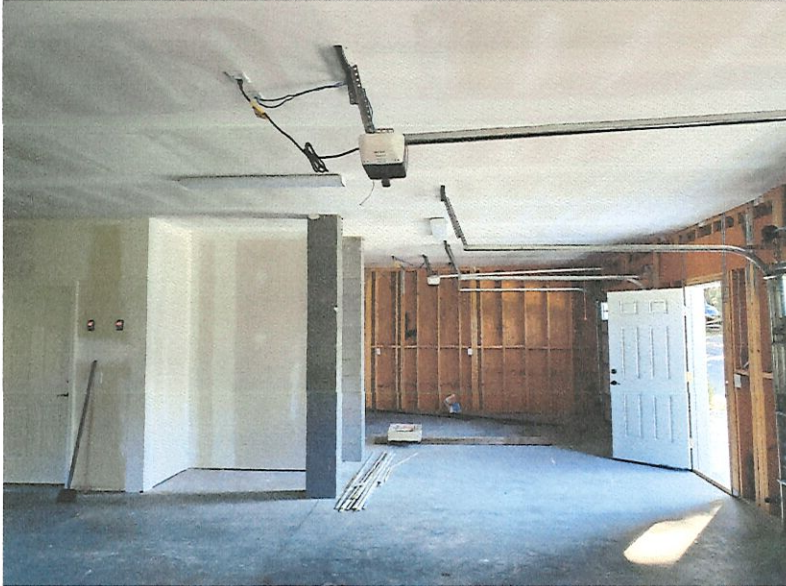
View of C2a below elevated floor C2b taken 10/04/2019

If submitting more photographs than will fit on the preceding page, affix the additional photographs below. Identify all photographs with: date taken; "Front View" and "Rear View" and, if required, "Right Side View" and "Left Side View." When applicable, photographs must show the foundation with representative examples of the flood openings or vents, as indicated in Section A8.