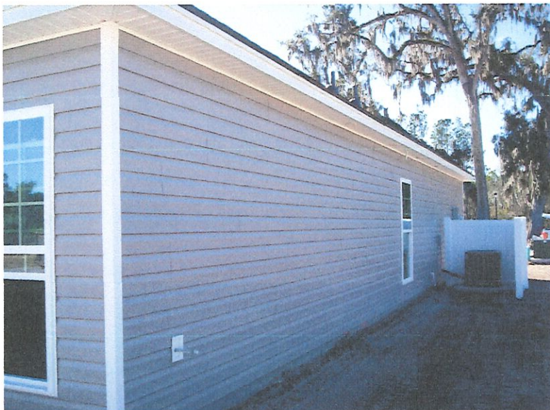
Left Side View taken 01/28/2020 showing the lowest servicing equipment for C2e