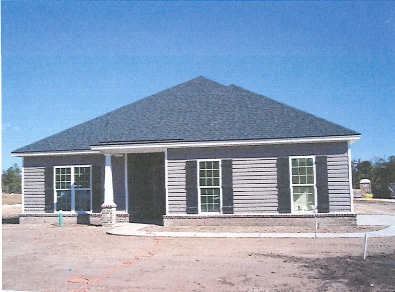
Front View taken 01/28/2020

If using the Elevation Certificate to obtain NFIP flood insurance, affix at least 2 building photographs below according to the instructions for Item A6. Identify all photographs with date taken; "Front view" and Rear view"; and, if required, "Right Side View" and "Left Side View." When applicable, photographs must show the foundation with representative examples of the flood openings or vents, as indicated in Section A8. If submitting more photographs than will fit on this page, use the Continuation Page.