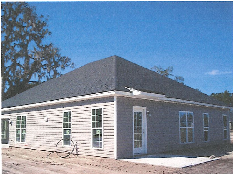
Rear and Right Side View taken 01/28/2020