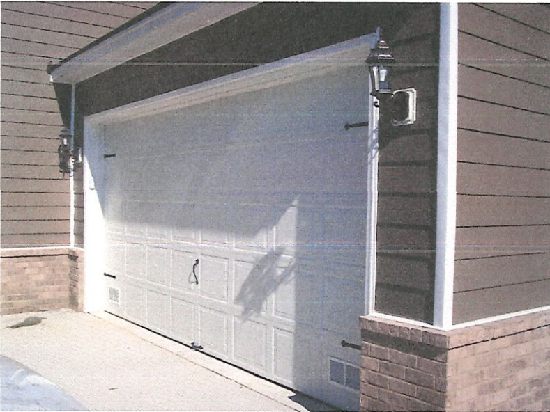
Front Right View showing non engineered flood vents