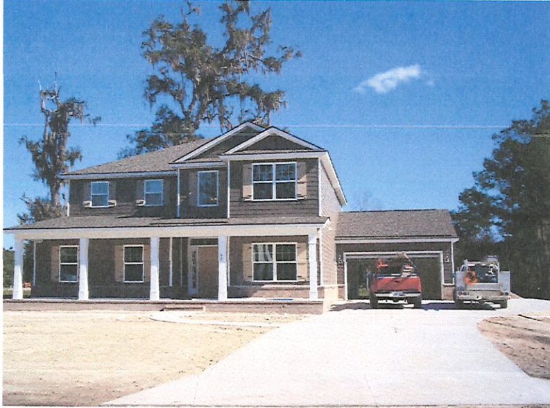
Front View taken 01/28/2020

If using the Elevation Certificate to obtain NFIP flood insurance, affix at least 2 building photographs below according to the instructions for Item A6. Identify all photographs with date taken; "Front view" and Rear view"; and, if required, "Right Side View" and "Left Side View." When applicable, photographs must show the foundation with representative examples of the flood openings or vents, as indicated in Section A8. If submitting more photographs than will fit on this page, use the Continuation Page.