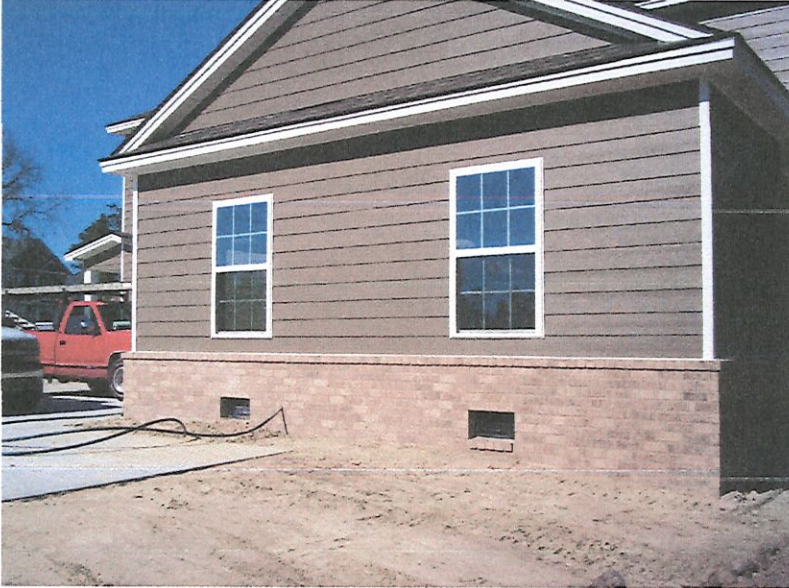
Right Side View taken 01/28/2020 showing engineered flood vents

If submitting more photographs than will fit on the preceding page, affix the additional photographs below. Identify all photographs with: date taken; "Front View" and "Rear View" and, if required, "Right Side View" and "Left Side View." When applicable, photographs must show the foundation with representative examples of the flood openings or vents, as indicated in Section A8.