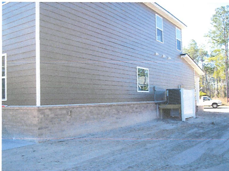
Left Side View taken 01/28/2020 showing the lowest servicing equipment for C2e