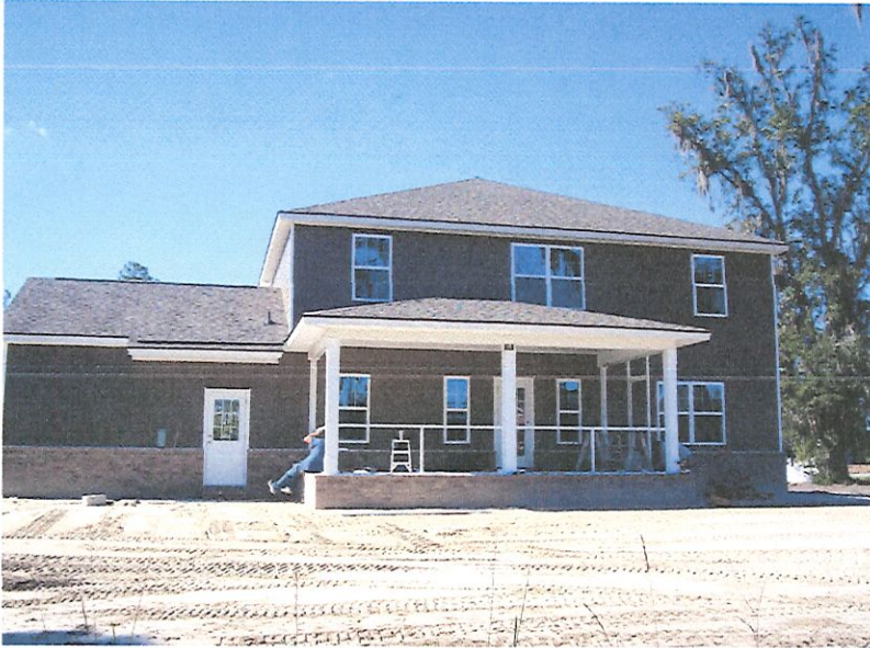
Rear View taken 01/28/2020