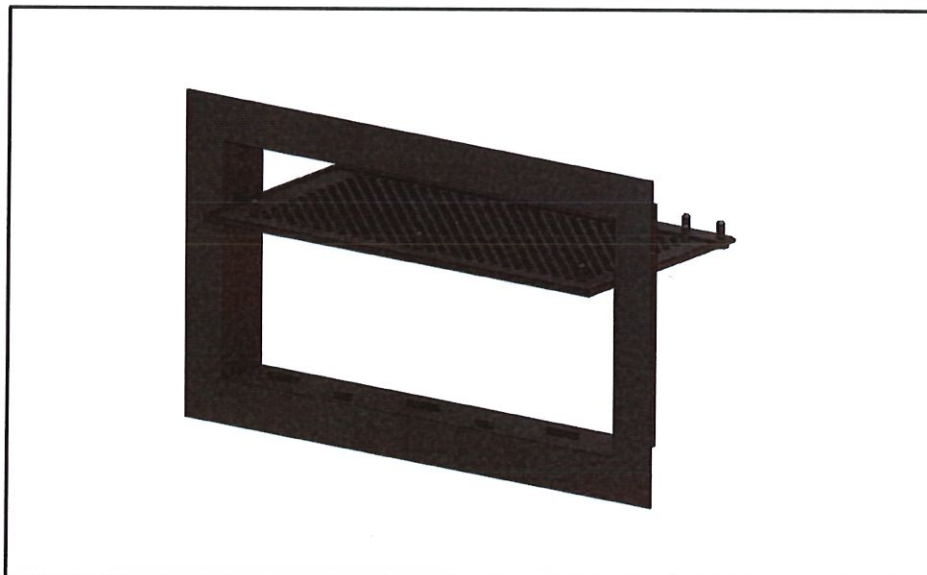
FIGURE 2—MODEL FFV-1608 FREEDOM FLOOD VENT™: SHOWN WITH FLOOD DOOR PIVOTED OPEN